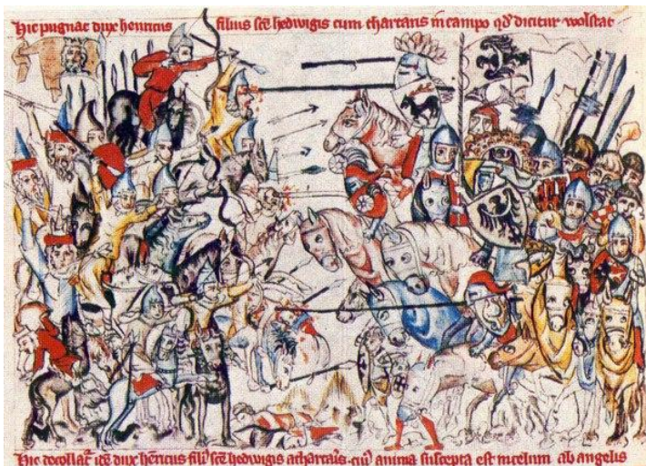
Battle of Legnica. European medieval miniature.

Having dealt with the Christian Russian principalities, the troops of Siberian Russia simultaneously invaded Poland with the invasion of Hungary. The cities of Poland are falling one by one under their onslaught. The "West", trying to rectify the situation, pulled together to help the Polish prince the main forces of the chivalry of Europe, which was planned after the liquidation of the Roman Empire to seize the lands of the Christian princes during their feuds and to convert the population to Catholicism, turning their lands into a continuation of the Catholic world of Europe. The hierophants decided to stop the Russian offensive on the territory of Poland and give a decisive battle. German, Austrian, French, Italian, and even Spanish knights arrived to help the Polish knights. Under the leadership of Prince Henry II of Poland, a 60-thousand-strong combined Polish army with European mercenaries and European chivalry, including Teutons, Templars and Hospitallers, acted. To help Henry, the Czech king Wenceslaus went with an army of about 50 thousand soldiers under the Czech knights. The European army was opposed by a 25 thousand Russian army under the command of Baydar.