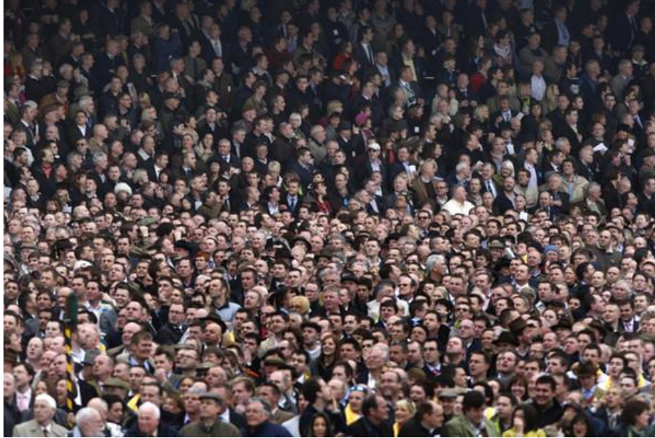
Figure: 2. Existence determines consciousness

Over the millennia, the progressive minds of the world's thinkers have constantly been directed by their research, their results, and their judgments, to resolve the main philosophical question - what is the purpose of people on Earth, what is the purpose of their life, and what are the goals of the development of civilization... Up until the present day, this has been far from an idle area of research, since the MOST STRATEGIC PARAMETERS for the common and local future and much more, depend on them. Therefore, they are of concern to leading thinkers both in Russia (which, unfortunately, are very few) and throughout the world. But, the practical results so far, create more questions than provide comforting answers, and only add MORE UNCERTAINTY IN THE FUTURE existence of not only a person himself, but also life on Earth as a whole, which more and more people have been convinced of lately. The beginning of the twenty-first century was not an exception to this, but on the contrary, exacerbated the problematic nature of all aspects related to existence. All structural forms and methods of the organized modern life of people are affected by the constantly growing scale of crises and social cataclysms. People have lost the ability to be rational.