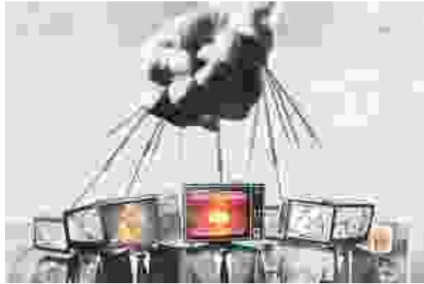
Figure: 1. We keep in touch with the people

The only power you can submit to, is the power of Reason