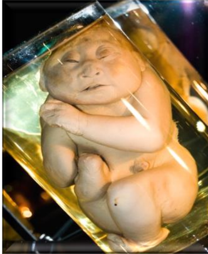
Figure: 4. Unusual people of the world

In the absence of control over the general processes of being, as well, as if there is a failure to maintain the energetic harmony of the entire environment, the most problematic issue of the existence of the former "intelligent life on Earth", cannot be sustained as such, since unorganized existence is able to liquidate itself over 3-4 generations of people! All the previously destructive vices acquired will work, like "squibs" for self-destruction. First of all, general brain degradation will play a significant role in this destruction. And this must not be allowed to happen, although today, in reality, this degradation of the so called "ruling élite" is already visible with the "naked eye." And to the question - "what is happening to our rulers, have they all gone crazy?" there is only one answer: without informational support from the former Control Complexes, most of the previously established functions in individuals of brain genotypes 42, 44, and 46 , cannot have an actively operational disposition. Their awareness of the surrounding "objective" reality, without informational support, becomes inadequate. People will lose not only the acquired level of knowledge, but also the practical experience of existence in the conditions of the perception of the environment as a reality for them, since this directly depends on the same informational support.