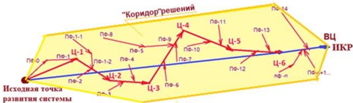
Рис. 2. Вектор цели развития системы

In addition, it is important to see the real state of the system in the past, present and future. That is why the chessboard on which politicians play should not be flat, but "voluminous," consisting of many sublevels (Fig. 1.): NS — suprasystems, S — systems, PS — subsystems ( PPP-subsystems, PPPS, etc ... ). That is why it is so difficult to understand information only of a factual nature, the level of its understanding (facts, deeds, dates, names), but its real essence is hidden at deep levels: context, subtext, sacred knowledge, causing political behavior.