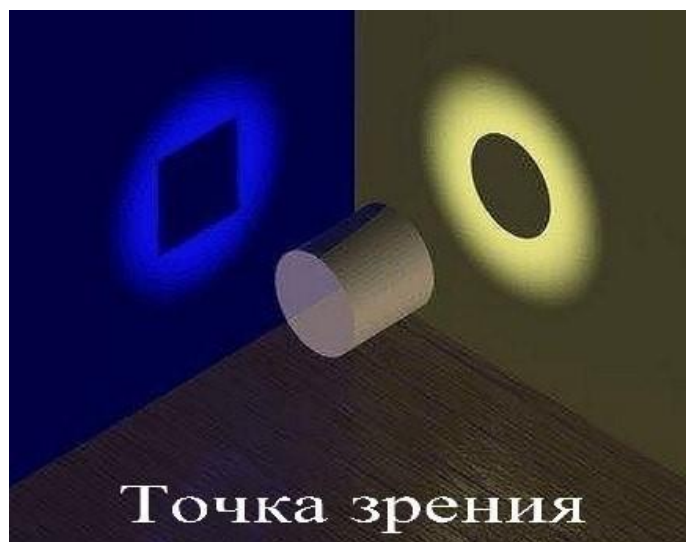
Point of view